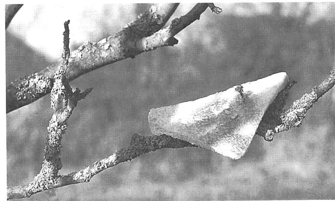
'Toasting' the trees

Members of the Group have carefully tended the Orchard since it was planted 10 years ago. This harvest is open to Ratby residents to pick when the fruit has ripened.